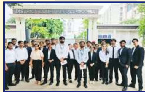
Karkardooma Courts Complex 16-August-2024