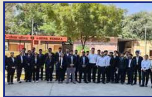
Amrit Udyan 15-March-2024