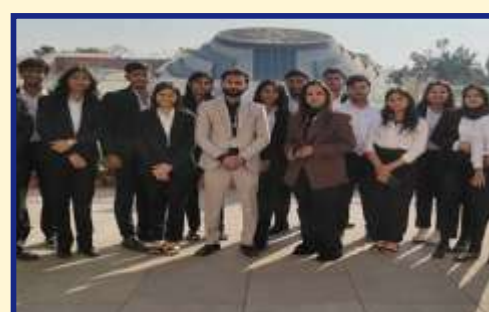
National Human Rights Commission 6-December-2024