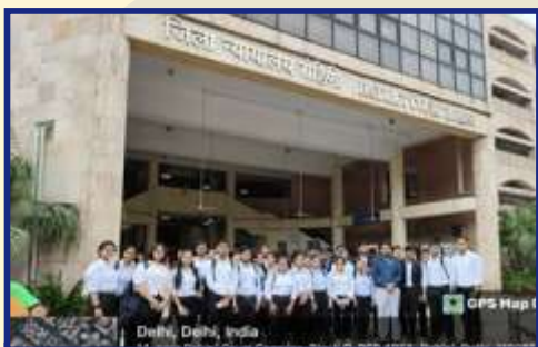
Mediation Centre Rohini Dist. Court 28-August-2024