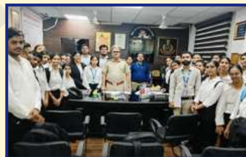
Rani Bagh Police Station, Delhi 03-September-2024