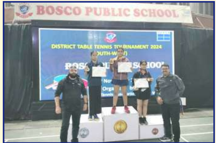
CPJ Girls Table Tennis Team | Silver Medalist

The CPJ Volleyball Team won the Silver Medal by finishing as Runner-up, exhibiting extraordinary coordination, spirit and athleticism.