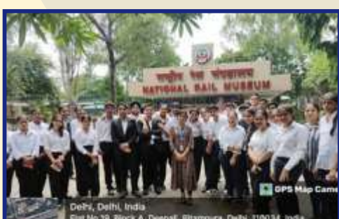
National Rail Museum, Delhi 06-September-2024