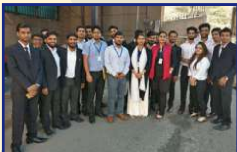
Tihar Jail, Delhi 31-August-2024