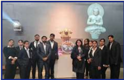
National Museum, New Delhi 10-February-2024

In 2024, the School of Law organized academic visits to District Courts, High Courts, Jails and Lok Adalats across Delhi. Students also explored historic monuments and the National Museum, gaining deeper insights into India's rich heritage and the foundations of its legal system.