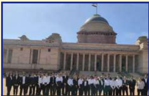
Rashtrapati Bhavan 15-March-2024