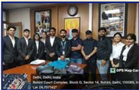
Rohini District Court, New Delhi 19-April-2024