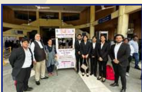
3rd National Lok Adalat, Delhi 14-September-2024