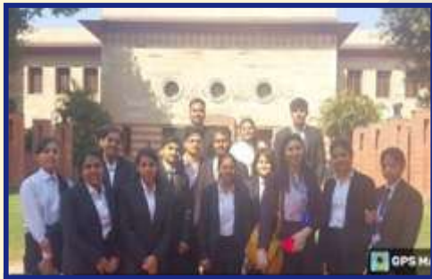
National Gallery of Modern Art 17-February-2024