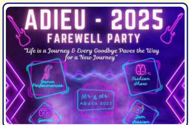
ADIEU-2025: 15 & 16 May-2025