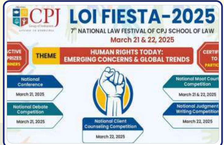
Loi Fiesta-2025: 21 & 22 March-2025