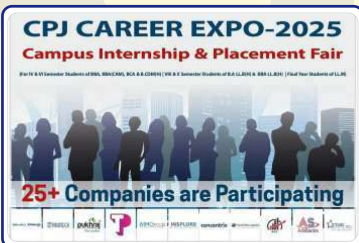
Career Expo-2025: 10-May-2025