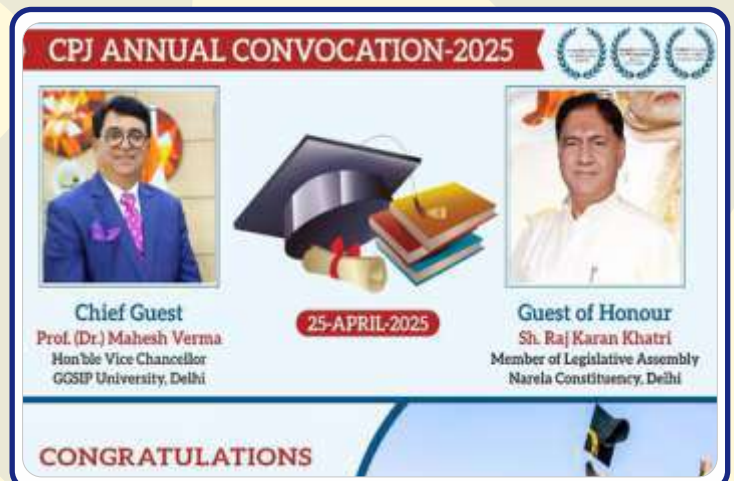
Annual Convocation 2025: 25-April-2025